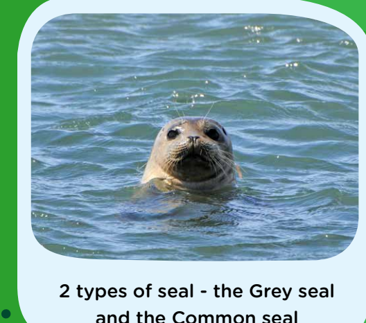
and the Common seal