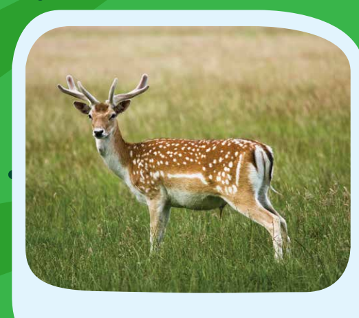
Over 20 land mammals