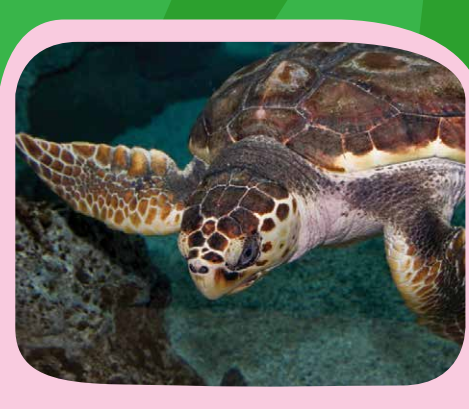
7 reptile species including four sea turtles such as the visiting leatherback turtle