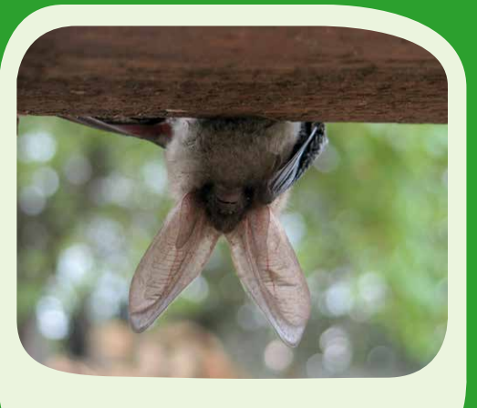
9 bats species