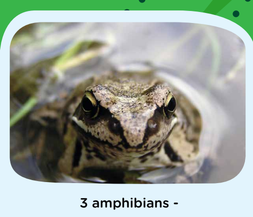
the smooth newt, common frog and the natterjack toad