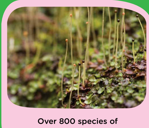
mosses and liverworts