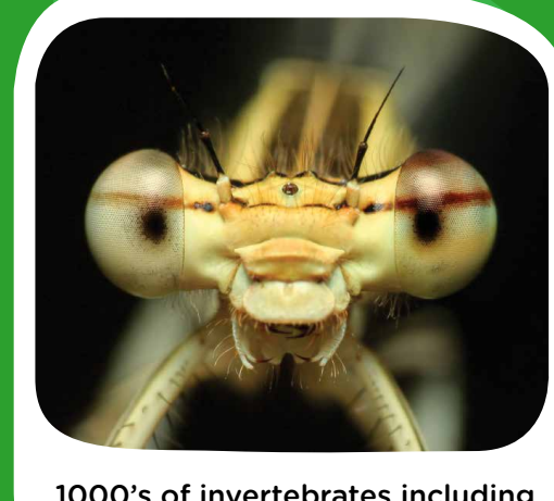
1000's of invertebrates including 3194 wasps, bees and ants!