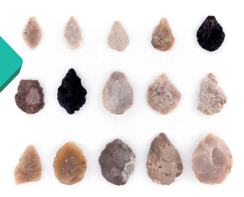
Selection of flint objects. Knockaulin, Co. Kildare, Neolithic.

At the Museum's Prehistoric Ireland Exhibition, there are many artefacts on display from the Stone Age, including flint tools such as arrowheads, axes, and spears.